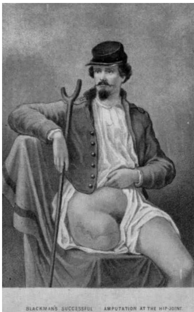
Fig. 2. One of the few survivors of disarticulation of the hip during the American Civil War. Note the large amount of soft tissue in the stump. From Otis (62).

Larrey reported that his first patient survived the operation well but a few hours later